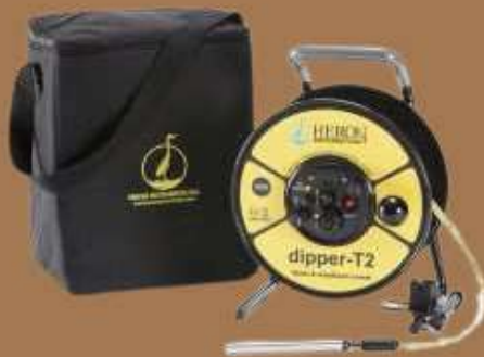
Heron water Level Meter