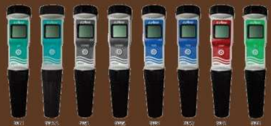
Ezdo Water quality Meter

** Please contact with us for any of your requirement related to Geo-Physical, Geo-Technical and Measuring equipment