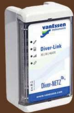
Van Essen Autologger